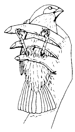
Figure 1a. Abnormal behaviour of a Thickbilled Weaver in a ringer's hand ...

I have been a victim of the above for one time too many. To escape the weaver beak, I take a suitable pill-container (Figure 1b) and ease it over the weaver's head (Figure 2). With the lid against the bird's back, I can ring and measure it and take bloodsmears. The container can be removed when taking head measurements because one has control over the head and beak while measuring it.