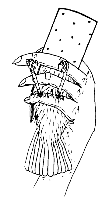
Figure 2. Positioned pill-container