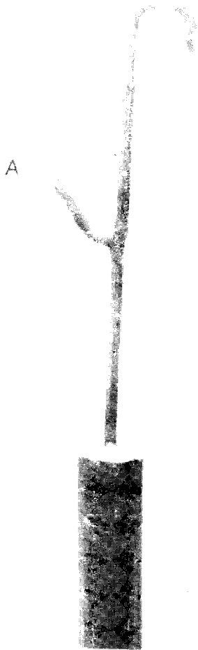
FIGURE 3 LIFTING AND LOWERING APPARATUS WITH ITS TWO HOOKS (A FOR LIFTING AND B FOR LOWERING)

Dave de Swardt, National Museum, P O Box 266, BLOEMFONTEIN, 9300