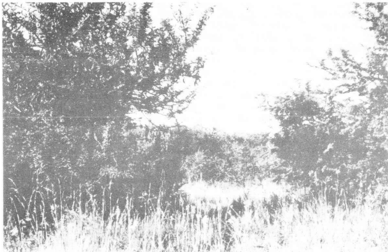
FIGURE 1: TYPICAL SUMMER HABITAT OF WILLOW WARBLERS IN HEKPOORT VALLEY. A VIEW OF THE FIRST STUDY AREA SHOWING Acacia caffra WOODLAND.

Care had to be taken when handling birds with any great amount of yellow below as this is a feature of first-year birds - especially of the nominate race. From an examination of the central pair of rectrices which in first-year birds are pointed (adults being rounded) (Drost 1951) and head feathers, which are invariably softer and downier in first-year birds than the freshly-grown firm feathers of the adults, it could be ascertained whether a bird taken before moult was in fact a first-year bird. These birds invariably had worn plumage, some with slight abrasion to remiges and rectrices, others with extreme wear, having broken primaries and tail feathers. There was also a tendency for first-year birds taken during October and November to show prominent skin at the corners of the gape.