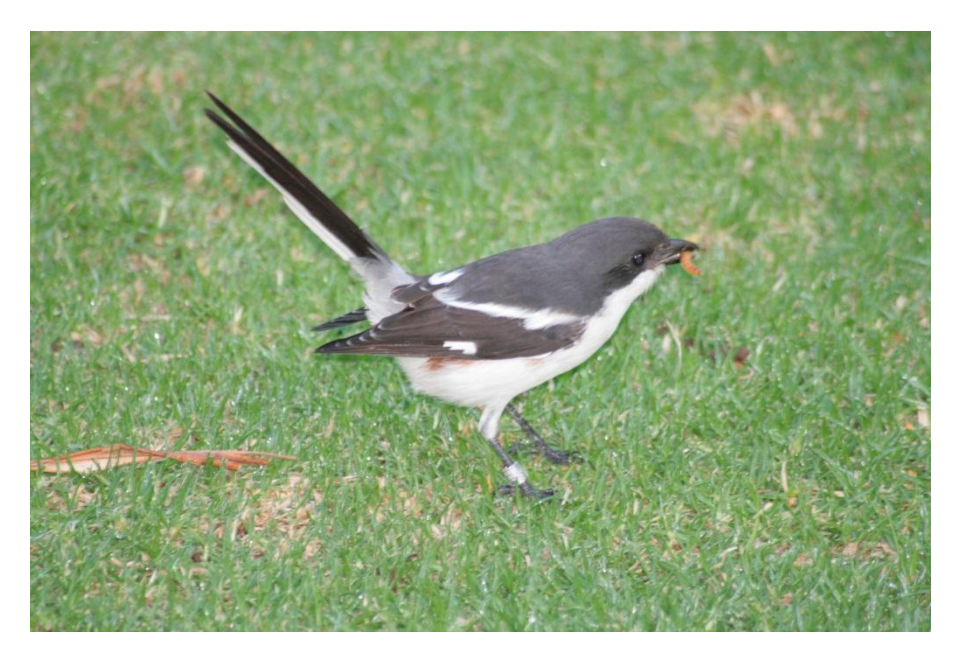
Figure 2 . Ringed Common Fiscal (Ring no: 4H44298) recaptured on 22 April 2011 in Fleurdal garden and resighted several times feeding on meal worms.