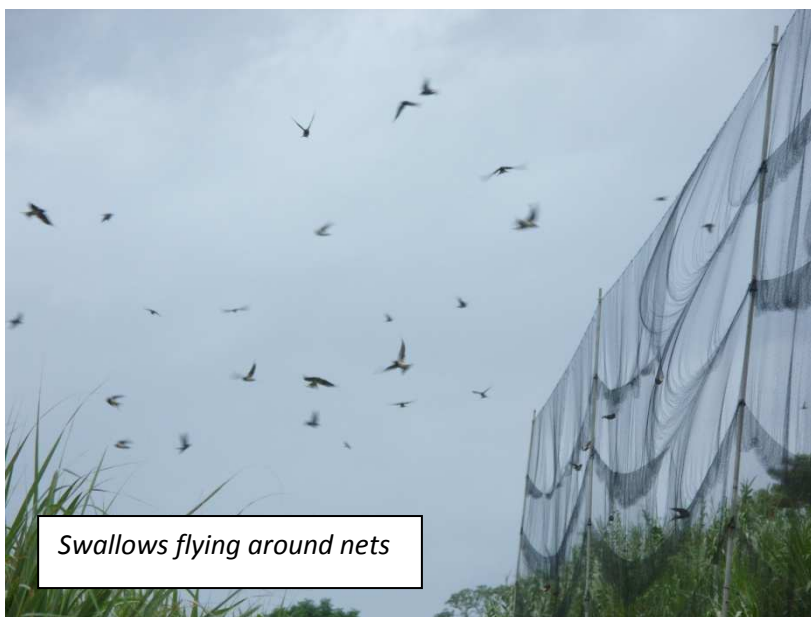
Swallows flying around nets

the birds with the quickest time being 27 days from ringing to recapturing. This bird was ringed in the Hawaan Forest area of Umhlanga Rocks on 12 April 1970 and recaptured in Whitely Bay, England on 9 May 1970 with a straight line distance between the two points of 9915 km. The second quickest was a bird ringed in Johannesburg and recaptured in Leninsk, Russia, 34 days later with a distance of 10 548