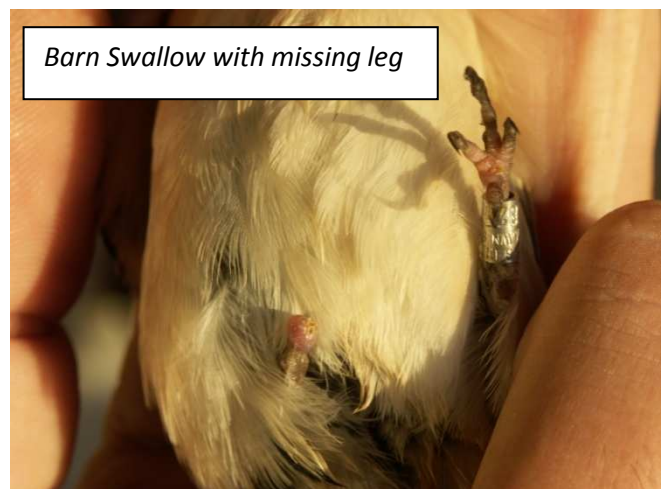
Barn Swallow with missing leg

In addition to the Mt. Moreland roost I recently started ringling at the Umzumbe roost on the KZN South Coast. This roost hosts about 1.5 million Barn Swallows. The roost is only accessible by crossing the Umzumbe River on foot, and not by vehicle. It is under no threat and hopefully will be utilized for many a year to come. My ringling site here is 900m from the roost (too great a distance to carry all the equipment to the reeds, also there are security reasons for the vehicle) and so has proved quite a difficult site to ring. Recent sessions have added another 589 captures in 6 weeks. The birds captured here have thrown up some very interesting questions. Two of the swallows had only one leg each, a most unusual