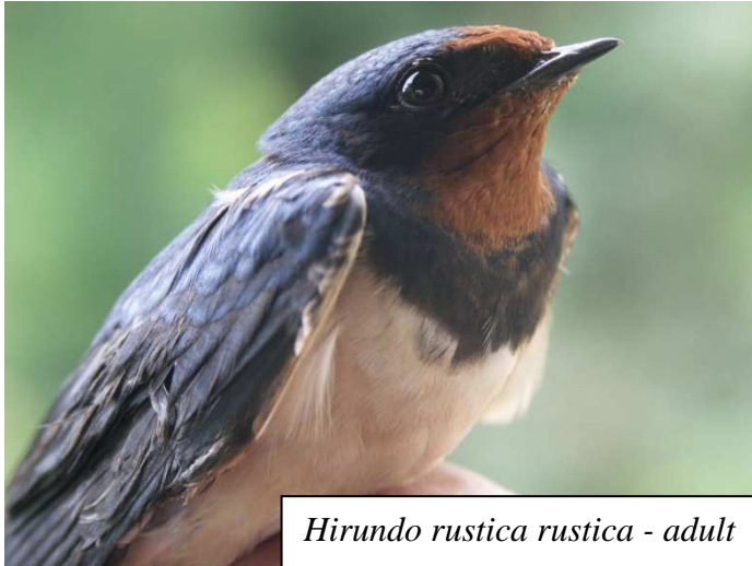
Hirundo rustica rustica - adult

The Barn Swallow, or the European Swallow as it was previously known, is a widespread and common summer visitor to southern Africa. It is often regarded as the announcer of spring/summer in both the northern and southern hemispheres; it is also one of most well known migrants in the world, which in a way makes it one of the most studied birds in the world. So why do we still study them? The answer to this is simple – they are amazing little