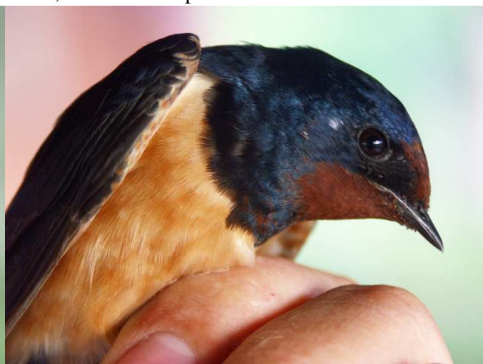
Another example of leucistic and dark reddish plumage