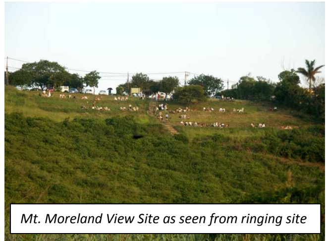
Mt. Moreland View Site as seen from ringling site

The three seasons of ringling at Mt. Moreland has allowed the ringling of well over 1000 swallows to date with only one recapture of a foreign ringed bird. This is not the return most people would expect, but it is still extremely rewarding considering the large size of the roost. Most roosts that achieve high returns are either small roosts of less than 30 000 swallows or large roosts of birds in a very small area. Mt. Moreland unfortunately does not match any of these criteria with an estimated 3 million swallows and a reed bed covering 35.5 hectares. The site has in the past been visited by overseas Barn Swallow researchers, the two most notable being Prof. Anders Pape Moller, who was contributed to the EIA process for the new airport, and Dr. Tibor Szep, as well as some local ornithologists like the late Professor Steven Piper. The sight of such a huge number of birds circling before plummeting into the reed bed is awe-inspiring and should be on everybody's wish list. The view site is open every evening during the swallow season, from mid October to mid April (for information and directions visit the website at http://www.barnswallow.co.za ).