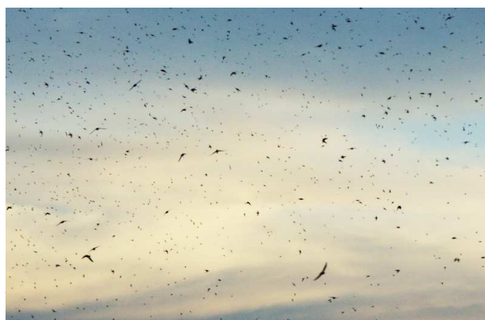
Barn Swallows massing before dropping to roost

After all of this I looked at the birds ringed within southern Africa at the start of the swallow season and recaptured later in the same season, showing that some of the birds ringed in the northern roosts in the region ended up at the southern roosts, giving a clear indication that the swallows use the large roosts on their migration southwards. This alone could be a worrying factor as any disturbance or damage to these roosts could cause problems for the southern birds on their migration, a point that is very relevant with the opening of the King Shaka Airport near Durban. Its runway finishes 2.6 km away from the reed beds at Mt. Moreland. In defence of the airport, a bird strike radar has been installed and if used correctly should prevent any bird strikes from happening.